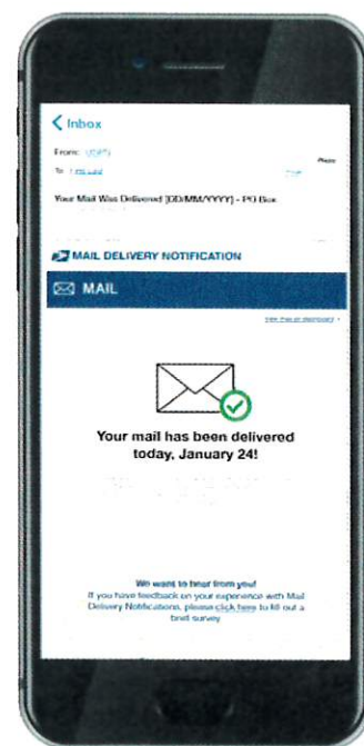
Notional design of cell phone with a Mail Delivery Notification email.

Thank you for your time and support as we provide our customers additional visibility into their mail!