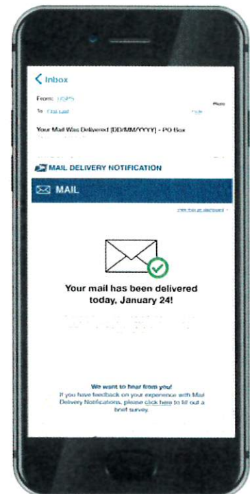
Notional design of cell phone with a Mail Delivery Notification email.

Thank you for your time and support as we provide our customers additional visibility into their mail!