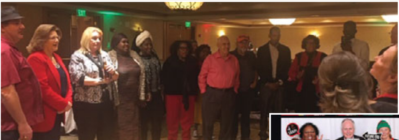
Branch 65 members were recognized for attending the holiday celebration.