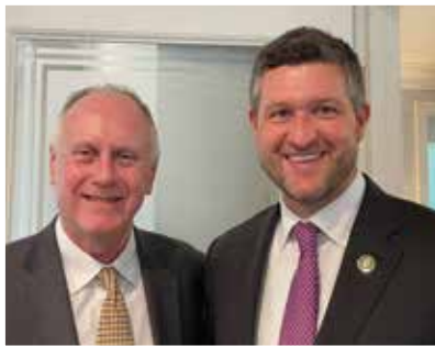
Rep. Pat Ryan (D-NY)