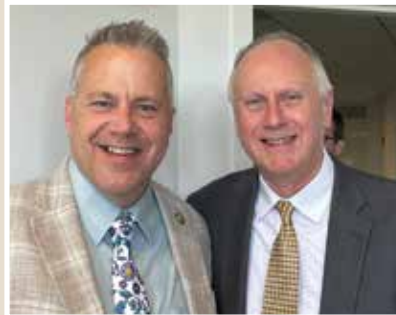
Rep. Eric Sorenson (D-IL)