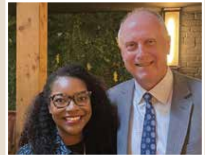
Rep. Emilia Sykes (D-OH)