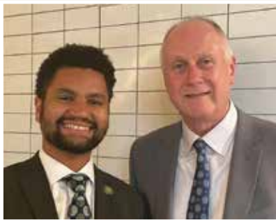
Rep. Maxwell Alejandro Frost (D-FL)