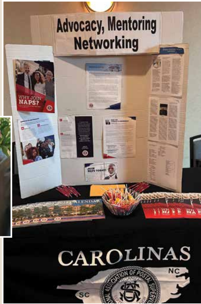
Carolinas Bi-State Branch 936 table