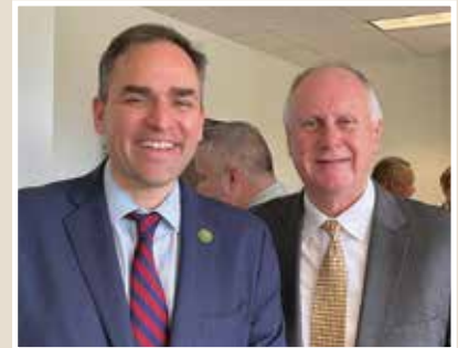
Rep. Wiley Nickel (D-NC)