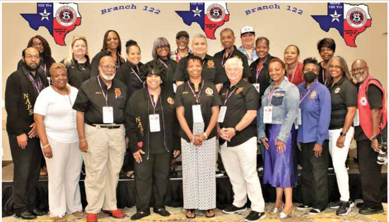
Houston Branch 122 hosted the event.