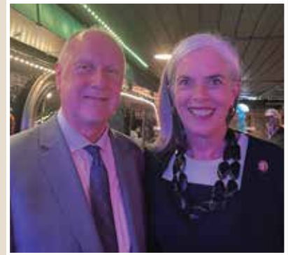
House Democratic Whip Katherine M. Clark (D-MA)