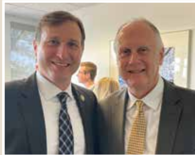
Rep. Dan Goldman (D-NY), House Oversight & Accountability Committee