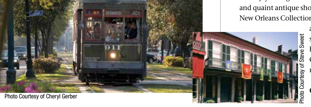
Historic New Orleans Collection

Duration: 2.5 hours. Cost: $35 per person.