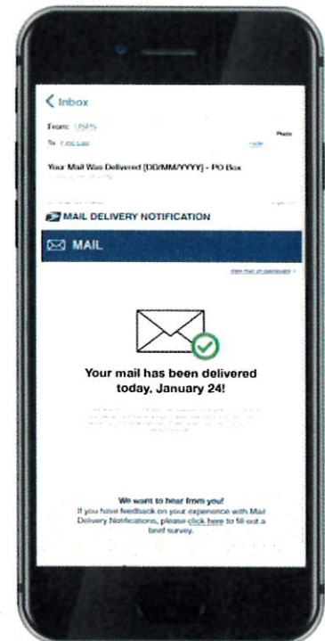
Notional design of cell phone with a Mail Delivery Notification email.

Thank you for your time and support as we provide our customers additional visibility into their mail!