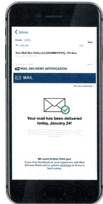
Notional design of cell phone with a Mail Delivery Notification email.

Thank you for your time and support as we provide our customers additional visibility into their mail!