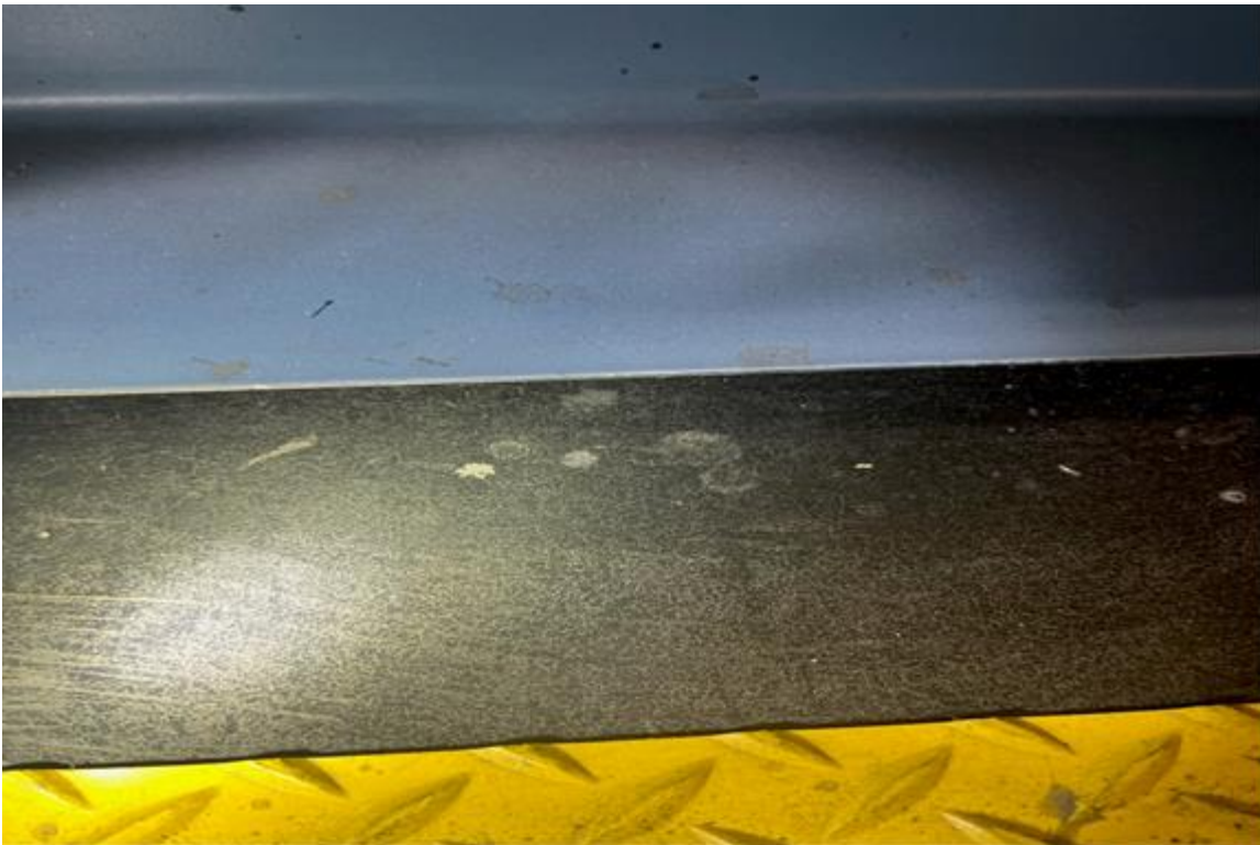
TWO PICTURES FROM EL PASO, TX P&DC DOCK