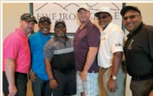
Participants in the golf outing during the Pennsylvania State Convention.