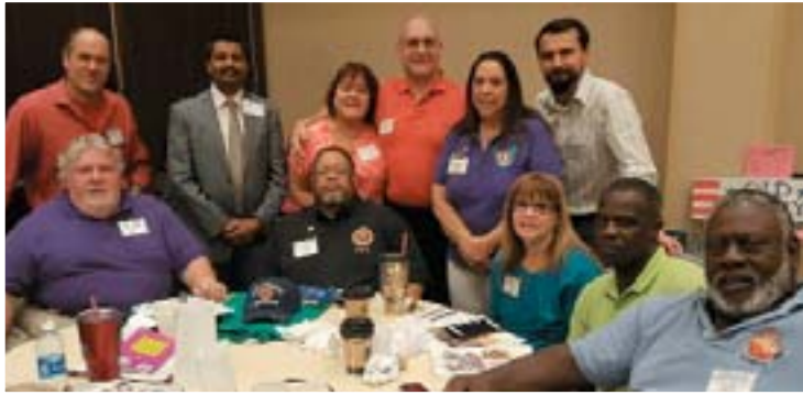
Delegates at the Florida/Georgia Bi-State Convention