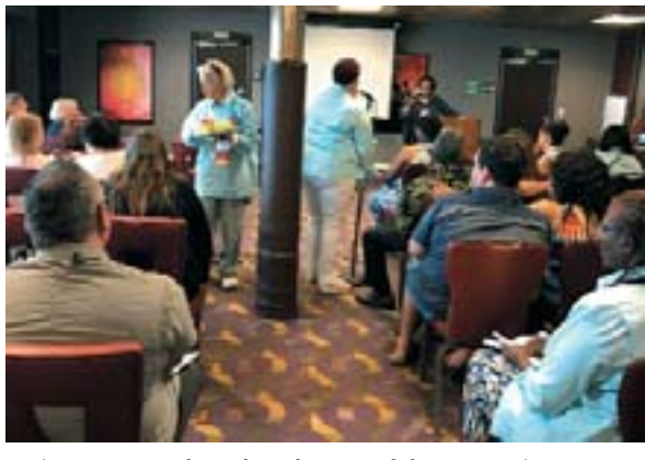
Business was conducted on day two of the convention.

conducted. Reports were given by convention committees. More than 20 resolutions were presented for first and second readings, including meeting with objectors and then being voted on by the body. The Postmaster Committee presented several recommendations.