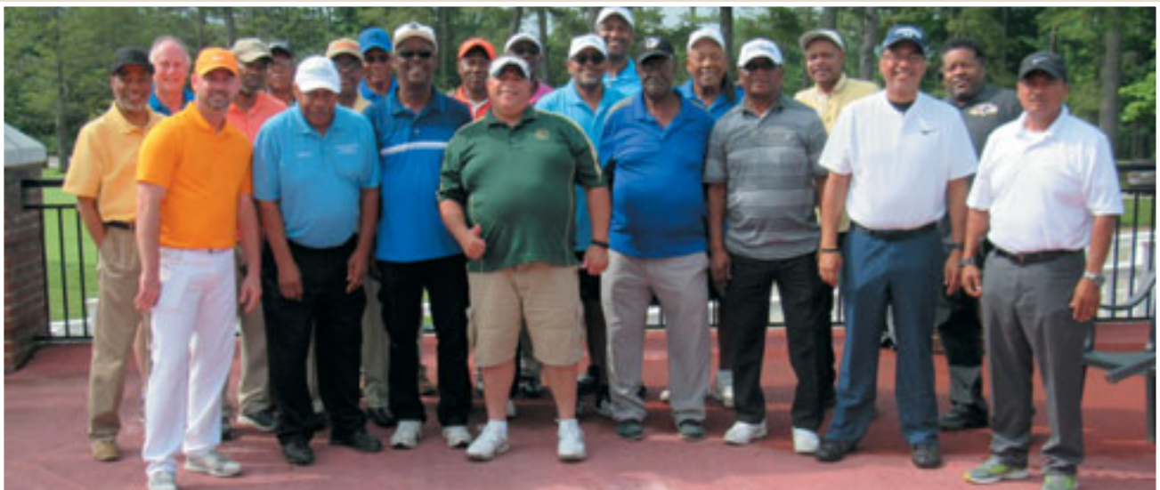
NAPS members attending the 2018 Capitol-Atlantic Area Convention participated in the annual Sandy Rankin Memorial Golf Outing.