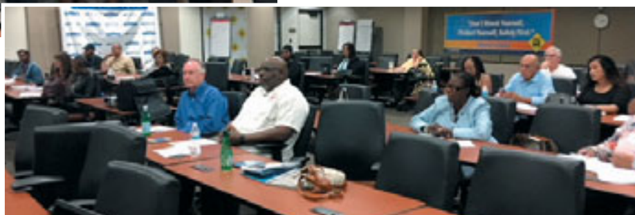
Attendees at the Pacific Area training for NAPS representatives