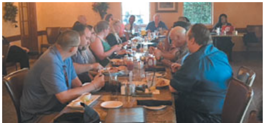
Las Vegas Branch 463 members had a productive meeting, with helpful networking and good food.

Branch officers reiterated that members facing Investigative Interviews should contact NAPS as soon as possible so a representative can be available to attend. Members also were reminded to read and understand the ELM 650 , which references EAS employees' rights and appeal procedures. Members were encouraged not to wait until the last minute to contact NAPS when a