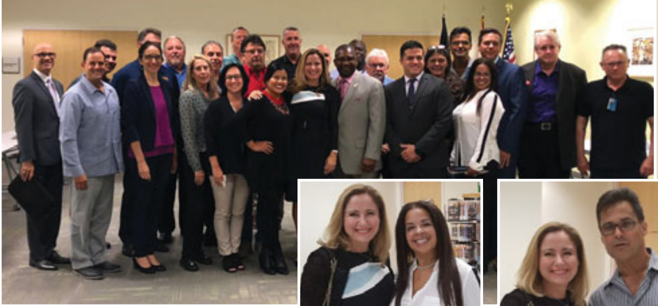
Rep. Debbie Mucarsel-Powell (D-FL) held a town hall meeting this fall. She expressed her continued support for legislation beneficial to NAPS and the Postal Service.