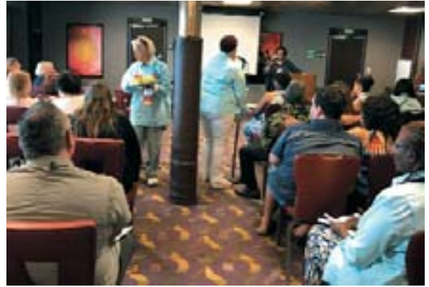
Business was conducted on day two of the convention.

conducted. Reports were given by convention committees. More than 20 resolutions were presented for first and second readings, including meeting with objectors and then being voted on by the body. The Postmaster Committee presented several recommendations.